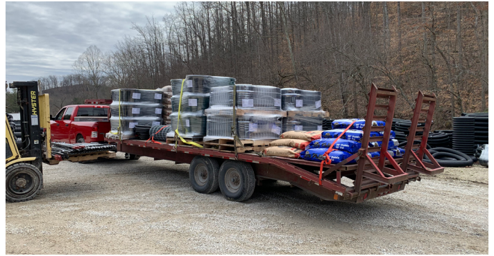
A trailer load of supplies getting ready for delivery to farmers.

The Office also served as a centralized location to receive agricultural items. Farmers were able to pick-up hay, livestock feed, and fencing. ANR agents in the affected counties also came to pick-up supplies to give to their producers. Donations were received from across the state, and the nation. In total, over $150,000 in donations were received by the Office.