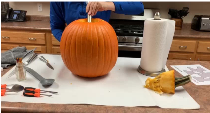
Clip Taken from Safety Video

3000 Number of youth who gained an understanding of the role of agriculture in the production of food, fiber, and wood products