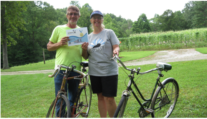
Recovery Run 5K Participants