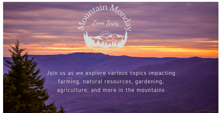
Logo used for marketing Mountain Monday

In response to COVID and the desire to continue programming, the Wolfe County ANR Agent offered a weekly virtual program for clients. The series was titled, “Mountain Monday Zoom Series” and it invited participants to “explore various topics impacting farming, natural resources, gardening, agriculture, and more in the mountains.” The series began in February and continued through April. Topics included: Small Ruminant Management, Preparing for Spring Gardening, Calving & Calf Health, Diagnosing Problems in the Home Lawn, Fruit Tree Grafting, Marketing at the Farmers Market, Raised Bed Gardening, Pond Management, Mushrooming & Foraging 101, and more. The series was a great success with many of the sessions having over 20 attendees. Participants indicated that they enjoyed the topic(s) and have gained valuable knowledge. The sessions were recorded and are available on the Wolfe County Extension YouTube page for later viewing.