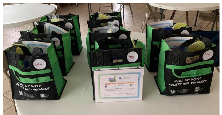
Family Meal Ingredients

During the COVID-19 pandemic, in-person classes would be unsafe to attend. The Wolfe County Supplemental Nutrition Assistance Program-Education assistants decided to partner with the Kentucky Agency for Substance Abuse Policy and offered classes through virtual platforms. Private Facebook groups were created to provide educational content to participants. Each assistant received a $500 grant from ASAP to purchase ingredients for 10 families to have seven meals and delivered research-based information from the Healthy Choices for Every Body curriculum which taught participants how to access food and ways to stretch food dollars during a pandemic. Surveys were collected on all participants data. The combined results of both assistants displayed 72% budgeted enough money for food purchases; 95% ate more red, orange, and green vegetables; and 72% improved their food resource management.