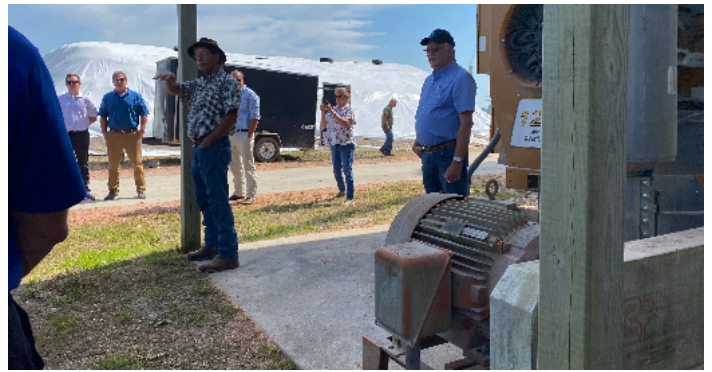
Community partners listen as a local Ag business man talks about his grain operation.

This behind-the-scenes look at local agriculture allowed community leaders the opportunity to meet the hard-working farmers and producers who keep the heritage of agriculture alive and viable in Pulaski County. This event not only gives those that are not involved in the day to day operations a chance to ask question but it also gives the farmer the opportunity to talk about the business side of our industry. This is an opportunity for both communities to come together on common ground and hear each other concerns.