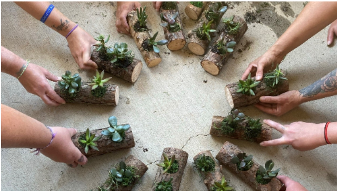
Sky Hope residents with their succulent plantings, September 2021