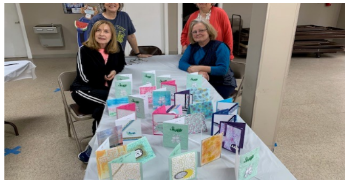
Homemakers hard at work making greeting cards and birthday card for assisted living residents.

With the help of Extension, the women have grown many different vegetables, learned about insects, diseases, and soils, and had their vegetables and herbs used in the kitchen. Since the facility has many residents, the garden isn't big enough to feed the entire population. Food chosen for the garden is designed to give residents exposure to different plants, different growing seasons, and different pests. It's also designed to grow food they enjoy as well. One Master Gardener and the KSU Area Agent have been great partners, coming up with other interesting topics to teach them about including succulents, hone