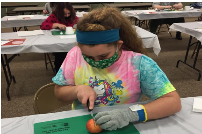
4-Her slices apples during chef club.

1069 Number of youth who know how to keep their cooking area clean to stop germs spreading