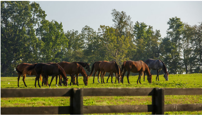
On farm fencing