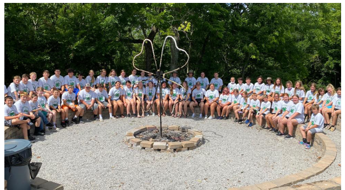
4-H Camp 2021

Over time, this program has allowed producers to implement new strategies to replace income loss from production of tobacco, and improve and diversify their operations in order to continue farming.