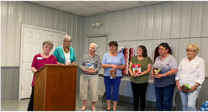
Awards at the 2021 Homemaker Annual Meeting

22 Number of individuals who reported improved knowledge, opinions, skills, or aspirations regarding the safe storage, handling, preparation and/or preservation of food