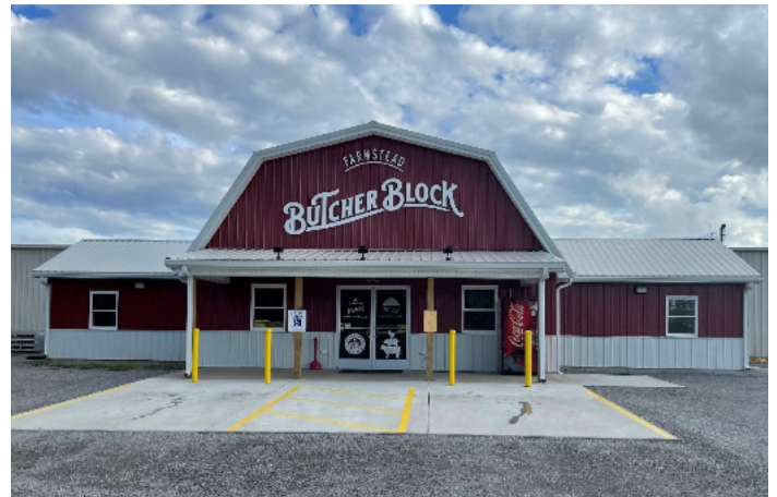
Farmstead Butcher Block in Muhlenberg County.

Club members distributed new flags and literature to 150 residents. Materials covering parts of the flag, how to properly display the flag, and the history of the flag were included in a booklet we titled "The American Patriots Quick Reference Guide." The club set a goal to increase patriotism and educate others on the U.S. flag and its values of liberty, justice, and equality. Members provided a service to our community, showcasing how to properly display and fold the American Flag.