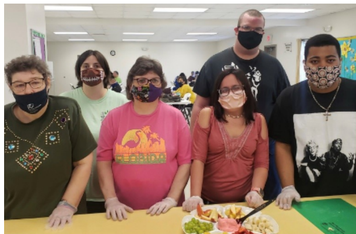
Muhlenberg County Opportunity Center clientele.

Members of the Muhlenberg County Homemakers Association have been involved in raising funds for this program since the late 1990s. The current treasurer of the Homemakers Association reported that they have given $27,262.50 in donations since 2012. Due to their efforts and level of financial support, members of the Muhlenberg County Homemakers Association were recognized at the University of Kentucky during an event proclaiming September 2021 as Ovarian Cancer Awareness Month.