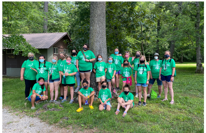
2021 4-H Camp

The success of 2020 is from the leadership of the market. Leaders and agents worked together to continue events and market programs at the market. At the first planning meeting of 2020 market leadership introduced a program with Gods Pantry as way to handle the left over produce at the end of sale day. In the first year with a relationship with Gods Pantry the markets provided 494 lbs. of produce for the 2 local food banks. With great leadership steering the market I see 40 more years in its future.