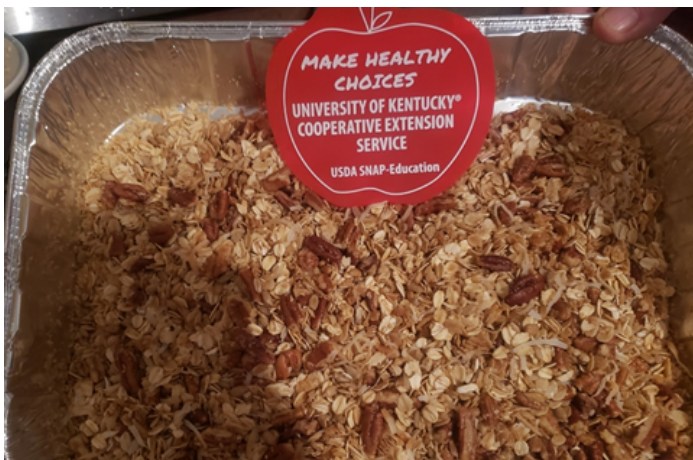
Chicken and Dumpling Soup made by Cook Together, Eat Together participating family.