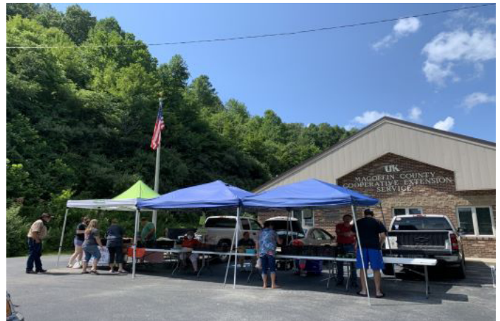
Social distancing continued through the COVID 19 pandemic.

Class participants were thrilled to have the opportunity to learn the history of and construct the only true Appalachian instrument, alongside their child/grandchild. Participants indicated the following: 100% said they would have never been able to participate in a class like this due to the associated costs (classes typically range from $275-$400 per person). As a result of the program, 20 Appalachian dulcimers are now in 20 Magoffin County homes.