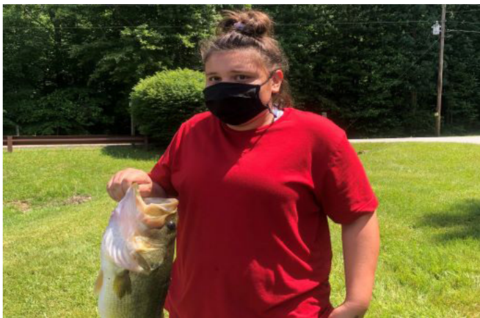
One of the biggest bass ever caught at camp!

1546 Number of youth who apply the skills learned in 4-H