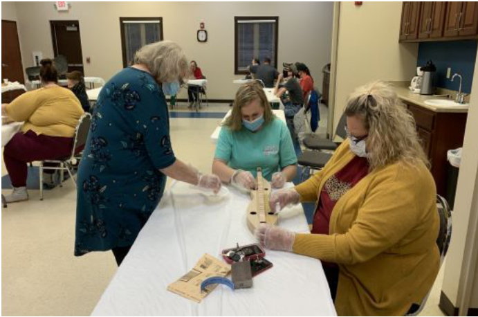
Intergenerational group constructing their dulcimer.