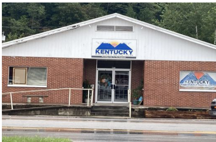
Kentucky Mission Bible Training Center is learning about Recovering Your Finances.

Although several of them had never been away from home for that length of time without family, they were able to bond with other campers and make new friends. From the time they got off the bus until the final campfire on closing evening, the campers were given opportunities for fun and excitement.