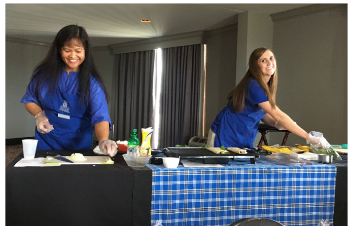
Cooking Class at Crab Orchard Elementary

In summer 2021, a nutrition class was held at Crab Orchard Elementary. For the first time in over a year, in-person programming was possible, but could not involve sampling foods. With the help of the Family Resource Center, I was able to provide a series on cooking and food safety for 70 kids in kindergarten through 5th grade. The Superstar Chef curriculum was used and a healthy recipe was demoed every week. The FRC coordinator then worked with the school cafeteria to give out the ingredients for the healthy recipes, so that the students could make the meals at home. The kids loved coming back each class and discussing what they had made and new foods they had tried. According to entry and exit evaluations, the K-2nd grade group showed a 72% improvement in their responses to dairy group foods and 72% improvement in food safety questions. 58% of 3rd-5th graders improved veggie consumption, and 53% reported drinking less soda.