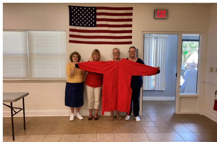
Homemaker display finished isolation gowns

In six meetings, 41 students received information on nutrition, physical activity, healthy snack options and food safety using the LEAP curriculum. Students were provided fruit snacks including oranges or tangerines, kiwi or apples. They played fun and active games to promote movement. Students showed a 71% improvement in identifying healthy physical activity. 63% of students improved in identifying healthy food options.