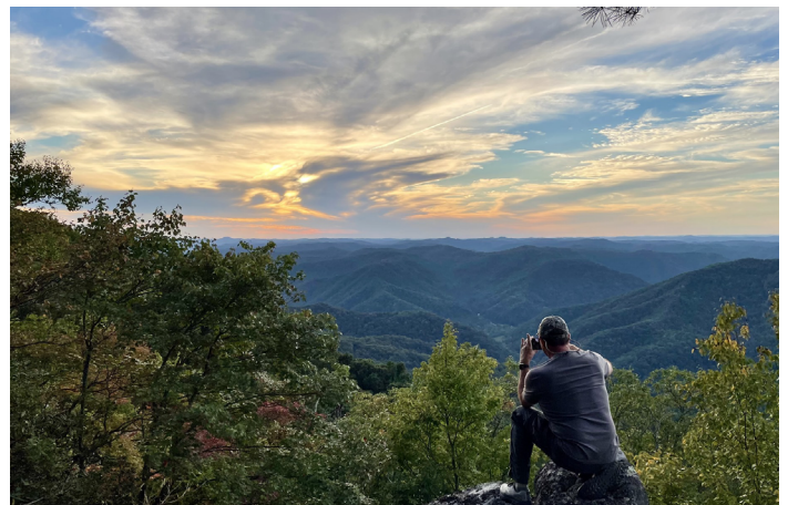
A Tourism Economy Catalyst

Twenty-two years ago, the Cooperative Extension Service helped launch a simple footpath along Pine Mountain. At the time, the thought was that it would serve as a nature-based tourism catalyst. With the project recently achieving a 60-mile milestone by connecting the Breaks Interstate Park in Pike County to the Kingdom Come State Park, it seemed fitting to recognize the unexpected payoffs. The trail has become a nature classroom, with Master Naturalists, many school groups and 4-H Clubs using its scenery and diversity of plant life to teach future Kentuckians the value of our mountain landscapes. It has been used as a volunteer project for those recovering from addiction. It has served as the regional focus for the Kentucky Trail Town Initiative, where communities connect to the Pine Mountain Trail. Letcher County Tourism has written $1.4 million in grants that are related to the program, of which $135,000 has been currently awarded.