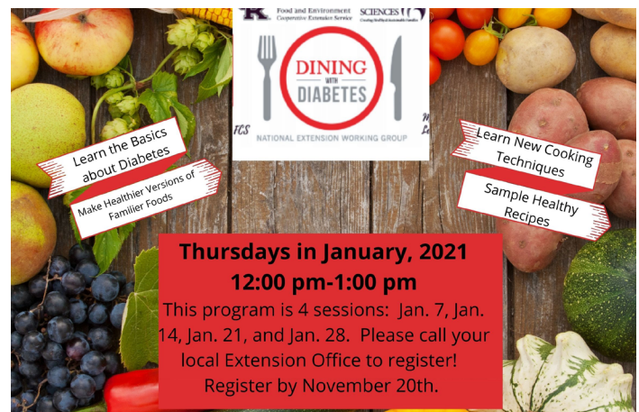
Dining With Diabetes

So far, 75 classes have been offered to over a thousand participants live, with double that count viewing on YouTube. The programs have also been provided to others through the government channel, which has a viewership of 88,000. Participants have reported implementing multiple disaster preparations such as having a three-day supply of emergency water, food and medical supplies, updating smoke detectors and checking fire extinguishers.