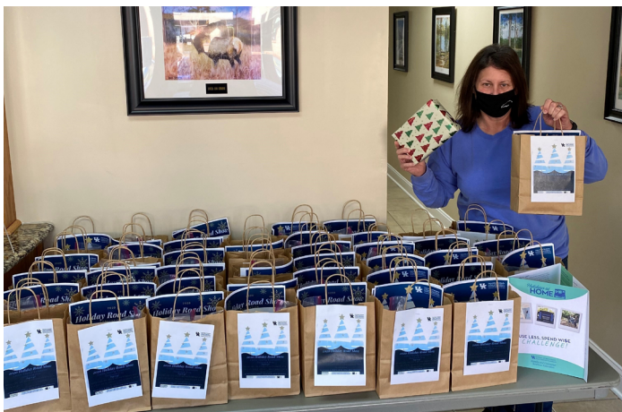
Holiday Road Show Grab-N-Go Bags