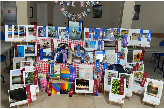
Kentucky State Fair Exhibit Winners