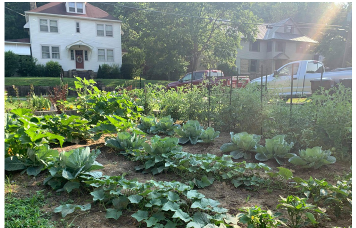
Community Gardening In All Spaces

Leslie County Extension FCS and 4-H Community Gardeners planted gardens with a variety of crops! There were large and small gardens, but for some, container gardening was a better option. Leslie County Extension offered a Container Gardening lesson sharing lots of educational literature along with the Farmer's Market Shopper's Guide. We explored the many pros of container gardening along with sharing our own experiences in gardening. Everyone planted their own tomatoes or peppers in a 5-gallon size fabric container inter-planted with lettuce seeds and onion sets. Container gardening offers opportunity to garden on a small-scale meeting needs of those with limited space and time for traditional, large-scale gardens. Lots of fresh farm-to-table sharing has been enjoyed across our county. Farmers from 4-H clover bud age to adult continue to practice their skills with families and community as they become gardeners!