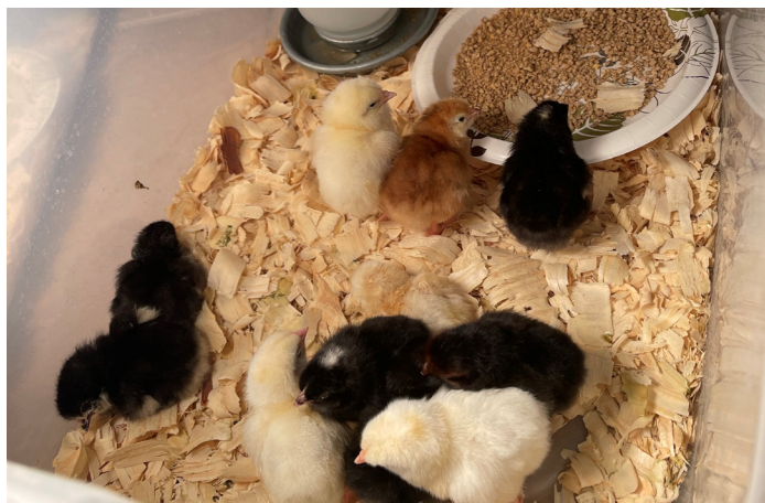
Chicks hatched in the incubator

In 2021, we did our first ever Virtual Chick Incubation in Leslie County. A series of interactive lessons were taught via Nearpod. A total of 210 youth in Leslie County participated in the series of interactive lessons! The incubators were presented which holds 7 eggs each. The eggs were placed on March 3, 2021 which gave us the anticipated Hatch Day of March 23, 2021. Throughout the lessons youth were taught embryology, how to add water for humidity, appropriate temperature, the many purposes of eggs, and youth labeled egg parts to fully understand their nutrition. Our last lesson was “Hatching” which reminded students how to properly care for the new baby chicks. The 2021 Virtual Chick Incubation Project was a huge success! A total of 38 eggs were placed inside the incubators and 34 eggs successfully hatched. Our Youth now have an excellent start on their knowledge of chickens.