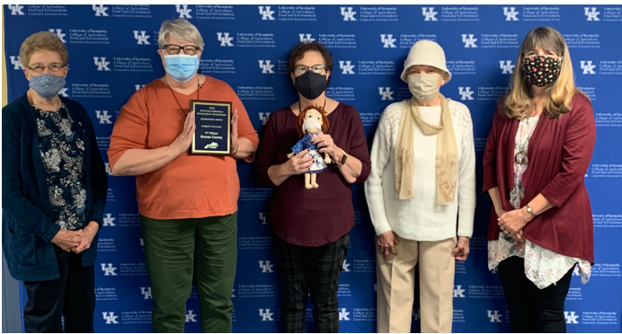
Largest Percentage Membership Growth