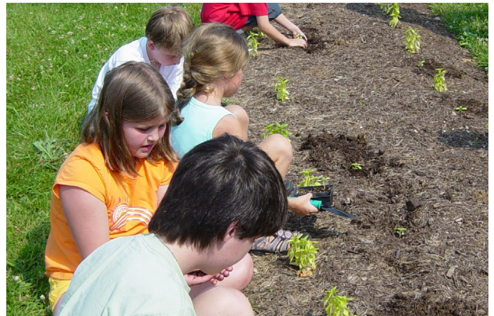
Children plant basil during a gardening program.

As schools began to open for summer programs, Fayette County 4-H was there to help provide activities for STEM Camps and regular summer programs. For middle school students these activities included rocket making, alternative electrical energy sources using lemons and wind, as well as the feeding habits of owls.