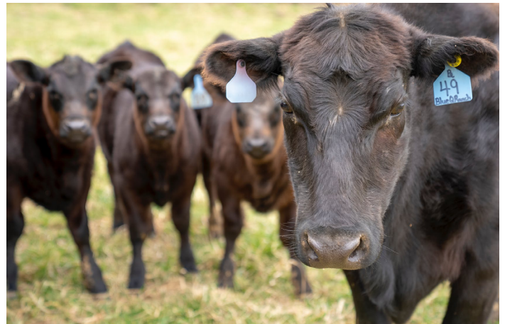
Beef cattle on pasture

Some of the kits were owl pellet discovery, embroidery, knitting, crocheting, leaf collection binders, family meal time, Zen garden kits, needle felting, & bird feeders 1,265 educational kits were picked up by Edmonson County families. Families were asked to fill out an online survey. Results showed 11% had never heard of extension before and 27% had heard of extension but had never utilized services or attended programs.