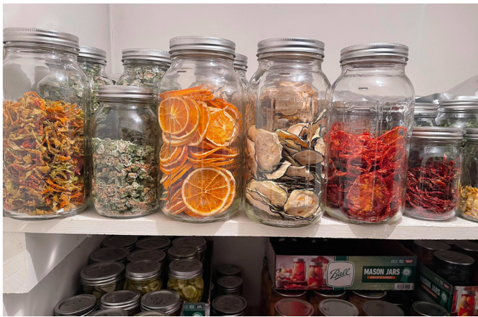
Dried fruits and vegetables from a client's pantry.