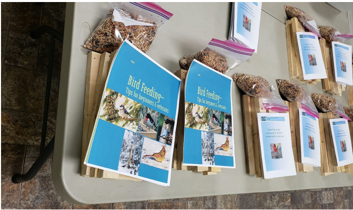
All about birds Extension-on-the-Go kits