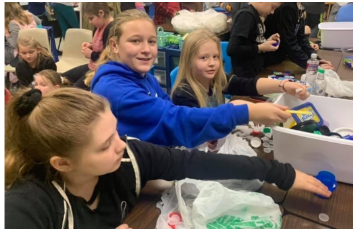
Youth in the 5th grade 4-H Civic Engagement