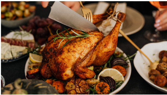
A Traditional Thanksgiving Meal