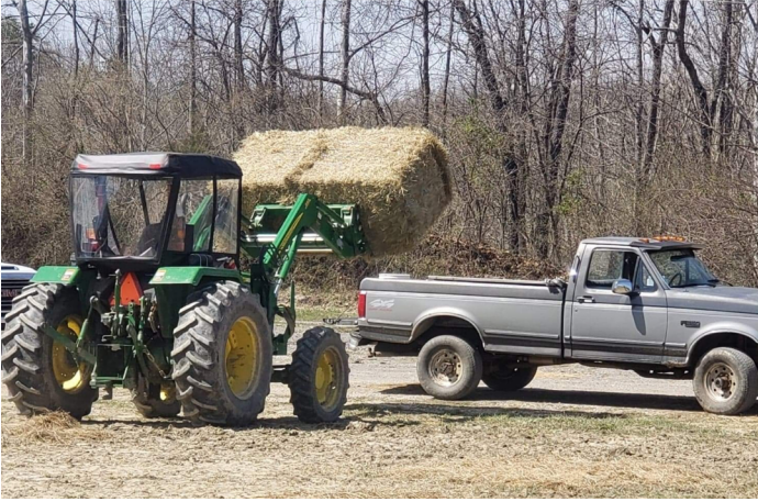
Helping local farmers during the storm