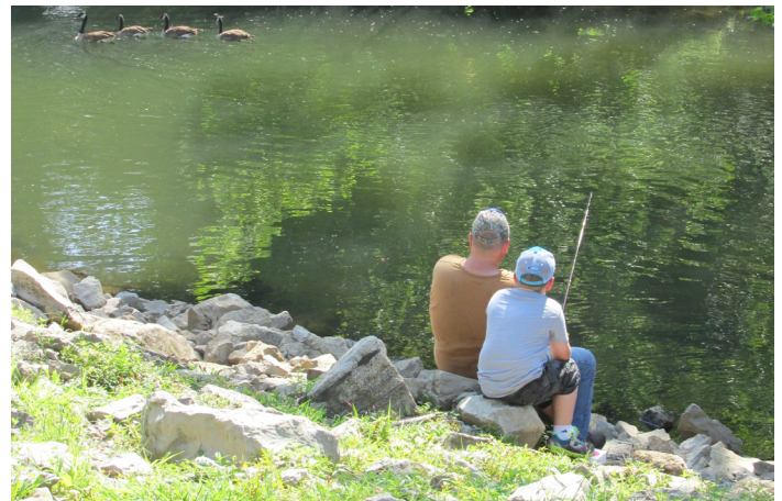
Father and son enjoying fishing

According to 24 million children in America -- one out of three -- live in biological father-absent homes. Almost thirty percent of families in Carter County are single parent families. In 2013 "Day Out with Dad" was developed to provide parenting education and celebrate fathers and father figures. In six years the program grew from nine participants to over five-hundred. Traditionally, the free event included fishing, birdhouse building, and games. In 2020 a drive-thru program was offered. Each family was given educational information about the important role of fathers, a book that they were encouraged to read to their children, family activities and games, and community resources. Participants reported that the program reminded them how valuable their role is as a father and they have a powerful impact on their child's success in school and life.