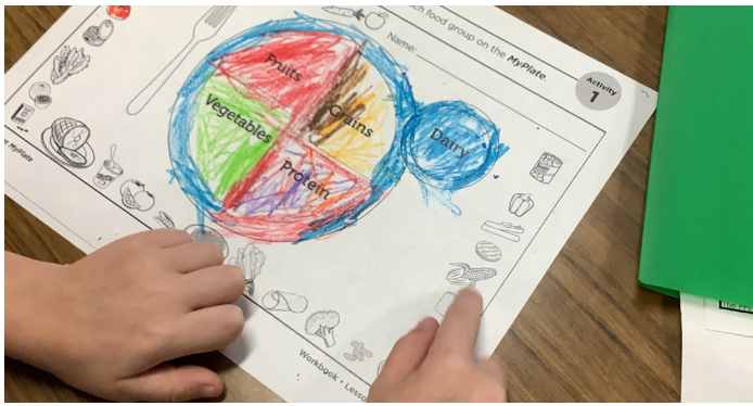
Student learning about the five food groups of My Plate during a LEAP lesson