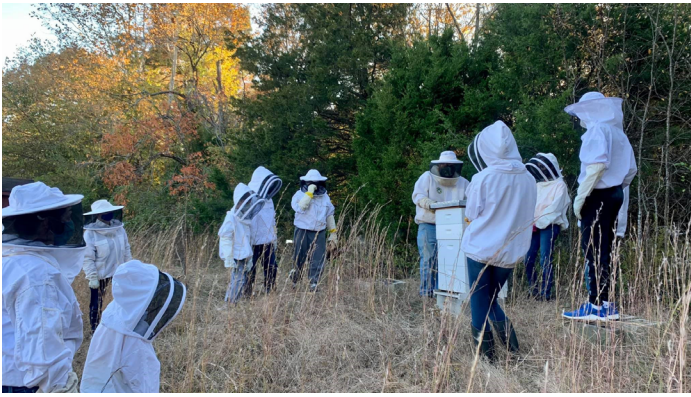
The Buzzy Bees seen performing an inspection on the Extension Office hive and prepping the