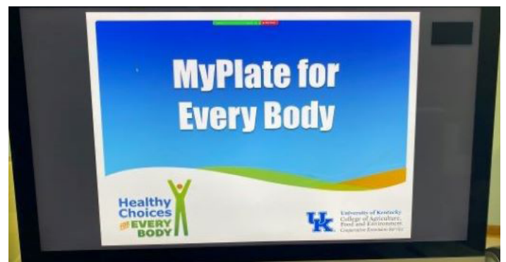
Breathitt County SNAP-Ed assistant preparing to begin for the online Zoom lesson.

The Breathitt County SNAP-Ed assistant continued to provide nutrition classes through Zoom, once a week to sixteen participants at KRCC. The Healthy Choices for Every Body Curriculum was used to cover several nutrition topics including meal planning, eating better on a budget, sodium, and MyPlate. 100% of participants showed a positive increase in a food group and eighty-seven percent of participants showed an increase in their food resource management practices.