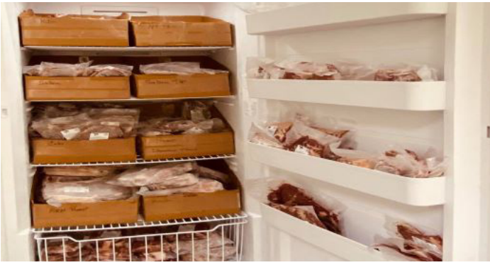
Pictured is a fully stocked freezer from a beef operation in Breathitt County.