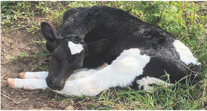
Calf adopted by local elementary school through Virtual Adopt-a-Calf Program