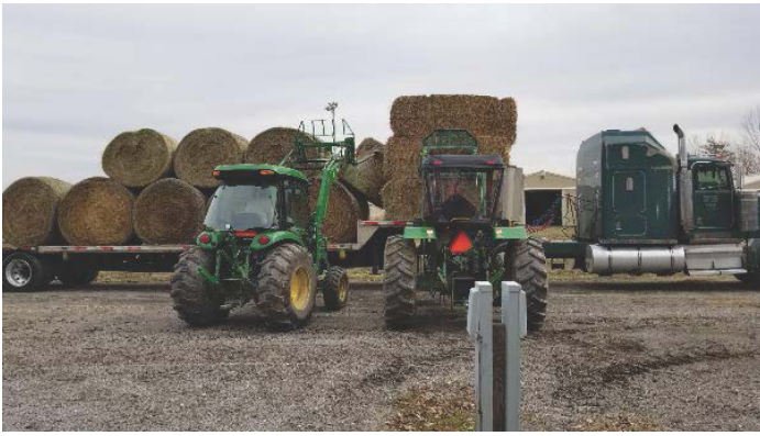
Unloading hay for Farm Relief Effort