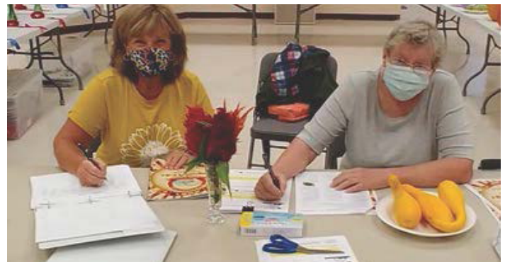
Master Gardener Volunteers work the Horticulture Exhibit at the Boyd County Fair

Master Gardener volunteers help expand outreach efforts of the Horticulture program in Boyd County. They are a vital part of the Cooperative Extension Service in the community by helping present educational programs using their gardening experience and knowledge gained through the Master Gardener class and educational programs at their monthly meetings. They volunteer to plan and execute extension programs, such as Farmers Market, the Holiday Wreath Program, Master Gardener Class, County Fair Horticulture Exhibits, Garden Shed Herb Day, Vegetable Field Day, as well as informational booths at community events and the general upkeep of the Extension demonstration gardens and landscape. This year has been a challenge with Covid restrictions, but the Boyd County Master Gardeners donated a total of 648 hours of volunteer time towards Extension programming. This is a total value of $14,256 to the community based on the Independent Sector.