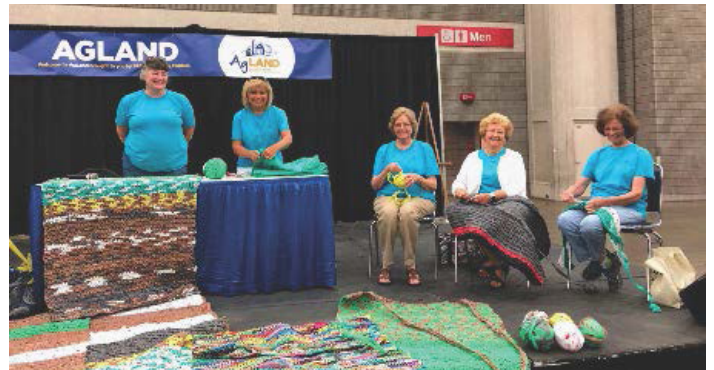
Homemakers demonstrate mat making

The value of the donated items, including product donations, cash donations and significant farm store discounts, was more than $25,000.00. We dispersed approximately 2,800 fence posts, 250 rolls of fencing wire, and 345 bales of hay. Additionally, we continued providing our composting program, a needed service for our livestock owners. This allows any farmer who has deceased livestock horses, cattle, goats, etc., to bring them to us to be disposed of properly and legally. The last couple of years we have handled arrangements for about 30 animal composts.