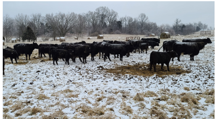
Dave Burge Bale Grazing Field

Conducting monthly individual producer meetings in addition to community educational field days were planned and executed by the Extension agent and Extension Specialists. The individual meetings that were conducted included examination for proper feed rates, herd rotation, fencing and bale placement, pre and post-feeding soil analysis, and bale GPS coordinates.